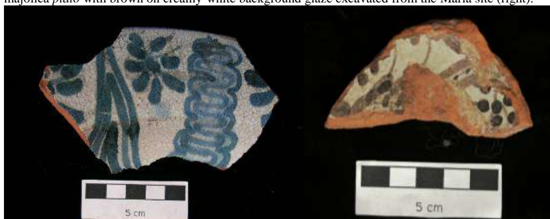
Figure 5: A Panama Blue on White plato – excavated from the Victoria site (left) and a locally made majolica plato with brown on creamy-white background glaze excavated from the Maria site (right).

decoration of Spanish majolica traditions. Jamieson (2004b) notes that the popular New World decorative style of the white tin-enameled background glaze with multi-colored hand-painted designs was an attempt to reproduce aspects of Chinese export porcelain, another popular elite ceramic commodity. Archaeological excavations at La Limpia Concepción showed a significant proportion of Spanish-style majolicas, including a number of imported majolicas from Seville and Panama (Figure 5).